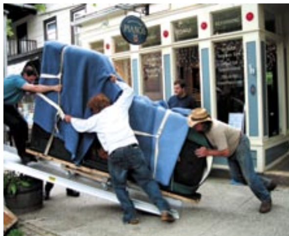
Leaving New Haven for its new home in San Francisco.