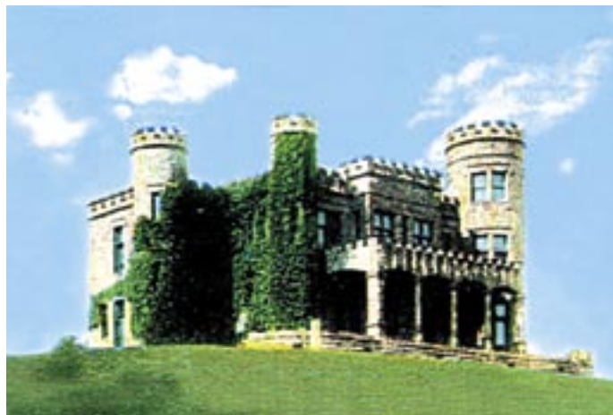
Kenilworth Castle in Holyoke, MA. Home to the Steinway D between 1885-1958.