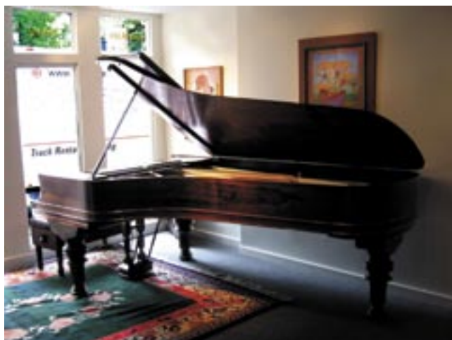
The piano’s last day in the New Haven Showroom on June 14, 2007.