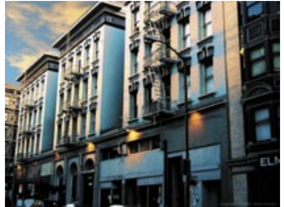
The Cadillac Hotel at Sunset

This is why the placing of this magnificent instrument at the Cadillac Hotel is such an appropriate memorial to her memory. Hopefully the power of the great music to be played here will be uplifting – and an inspiration to the residents of the hotel and the Tenderloin. (For more information visit: www.patriciawalkup.org )